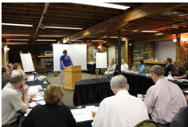
CFNL's 2012 Annual General Meeting

2012 marked the 10 th anniversary of the Community Foundation of Newfoundland and Labrador's registration as a charitable organization. In the decade since then, CFNL has built an endowment of over $800,000 and disbursed more than $250,000 in grants to community organizations across the province. CFNL celebrated its 10 th anniversary with a reception at Government House in St. John's on May 14 th , 2012, kindly hosted by CFNL's patron, the Honourable John C. Crosbie, Lieutenant Governor of Newfoundland and Labrador.