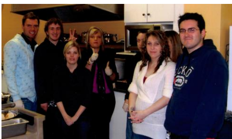
Choices for Youth staff and clients of their “Jumpstart for Youth” program have fun in the kitchen while learning nutritious food preparation.