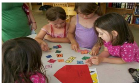
Gathering numbers found on a scavenger hunt, participants of the NL Laubach Literacy Council’s “Summer Reading for Fun” enjoy themselves while learning.