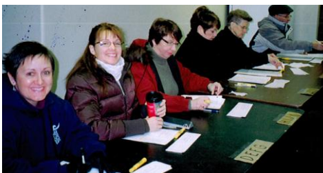
Grand Falls FoodBank volunteers prepare for clients receiving food hampers for Christmas.