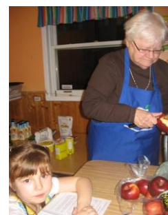
Young single moms and seniors gather for the Senior's Resource Centres Healthy Cooking program in Spaniard's Bay.